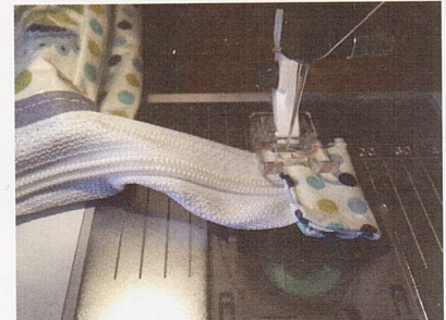
Attach zip tabs

NOTE: the zip acts as a feature of the bag and sits on the outside of the top edge rather than underneath it.